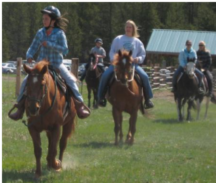
Riders head out on the trail for the Poker Ride

Our largest fundraising event this year was a Tack Swap Meet and Poker Ride held at Ghost Rock Ranch in June. There were 73 riders with additional people who attended for the swap meet. We raised a total of $3,346, and we also collected 350 pounds of canned goods.